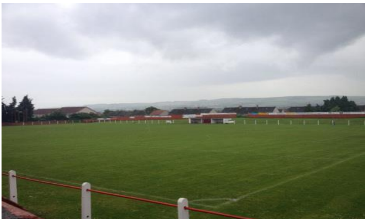
East Side & Orchard Side

The southern side has no stands but does have a grass bank which, due to the natural slope of the arena, steepens as you work your way to the western end. Unusually, the club have taken advantage of this by installing metal barriers in the grass in the same way as you would normally find in a concrete terrace. In the middle of this side are two dugouts at the bottom of the grass bank meaning that spectators can stand behind these without their views being hindered and the areas behind the two goals are more restrained than the two sides. The eastern goal has a small, but steep, grass bank with an uneven four level concrete terrace built into the northern half of this end. Meanwhile at the other goal there is a grass section which slopes up towards the northern end and a covered four level concrete terrace in the Orchard End north-west corner with netting running the length of this side to prevent balls landing in the gardens of adjacent houses.