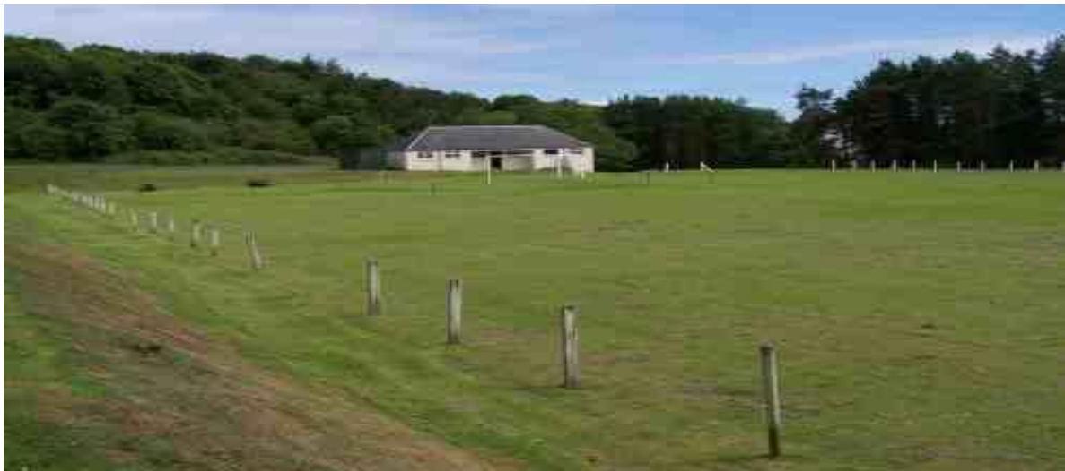
2013 before 4g pitch lay