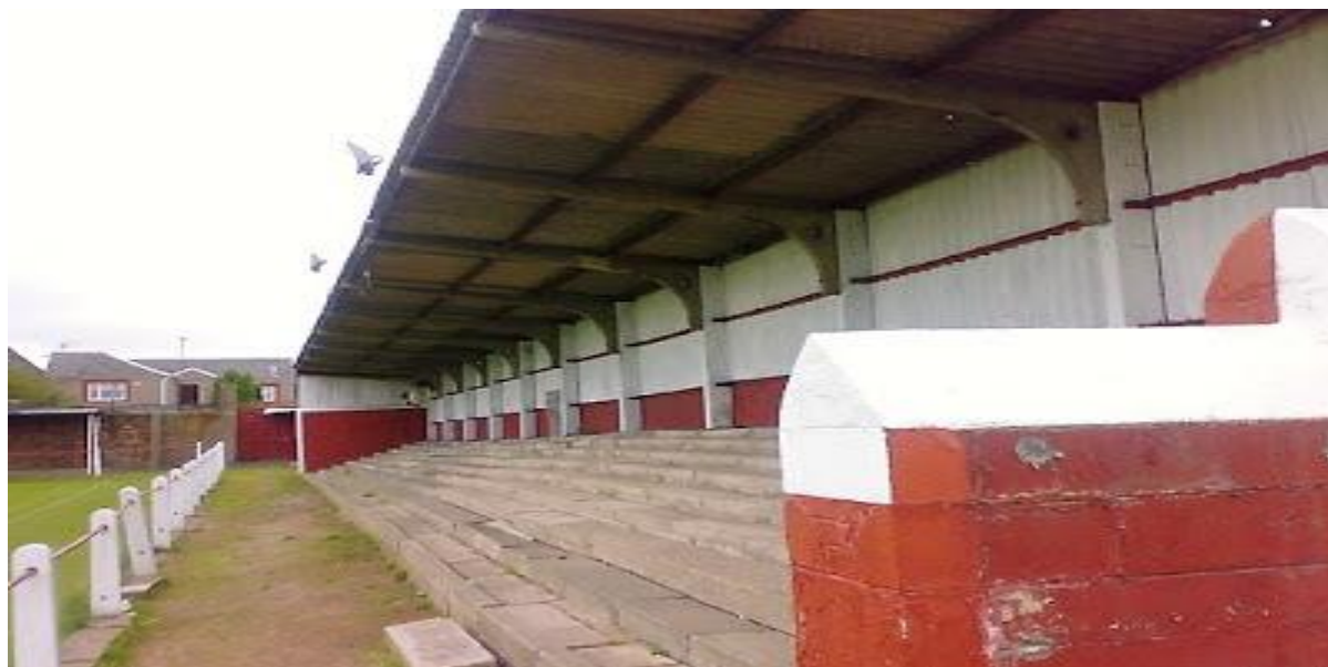
Main Covered Stand

New Dundas Park is located in the centre of the town and over the decades has gradually been penned in by housing developments requiring additional land around the ground. This means housing borders the complex on all four sides with only a small parcel of land beyond the northern side for a car park and social club with New Dundas Park has been home to the club since 1953.