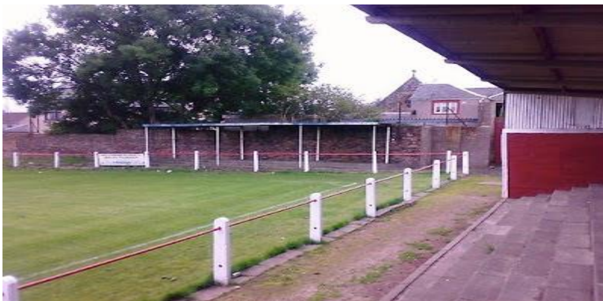
Dundas Street Covered End

The southern side has no stands but does have a grass bank which, due to the natural slope of the arena, steepens as you work your way to the western end. Unusually, the club have taken advantage of this by installing metal barriers in the grass in the same way as you would normally find in a concrete terrace. In the middle of this side are two dugouts at the bottom of the grass bank meaning that spectators can stand behind these without their views being hindered and the areas behind the two goals are more restrained than the two sides. The eastern goal has a small, but steep, grass bank with an uneven four level concrete terrace built into the northern half of this end. Meanwhile at the other goal there is a grass section which slopes up towards the northern end and a covered four level concrete terrace in the Orchard End north-west corner with netting running the length of this side to prevent balls landing in the gardens of adjacent houses.