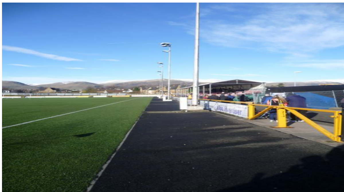
Hilton Road End