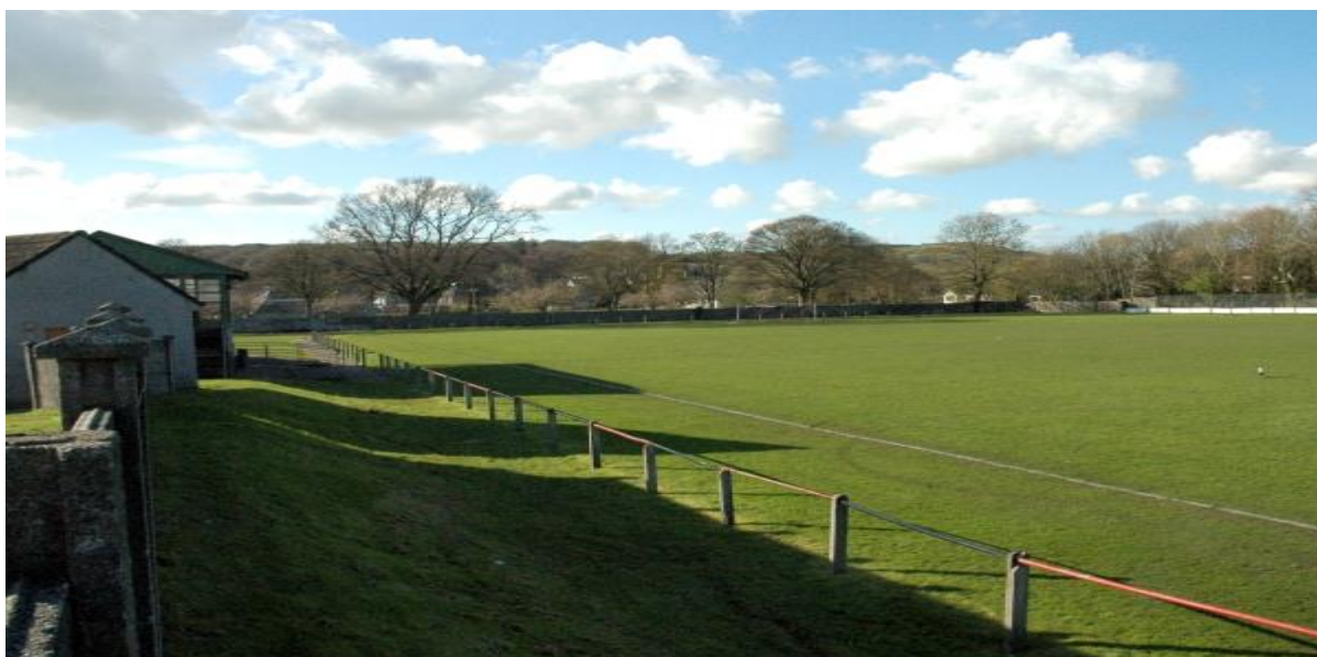
Riverside End & Main Stand

Train to Dumfries Railway Station and walk it down to the Loreburne Centre 1 Nith Place bus stop, by walking you turn left onto Lovers Walk at the end turn right past the Waverley Bar and down St Marys Road and follow the sign for Stranraer by taking a slight right after the church into English Street and keeping on walking till you come to the Army careers office.