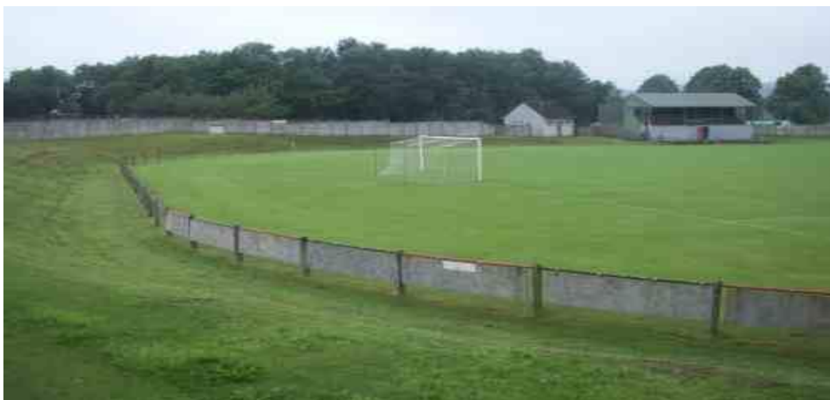
Main Stand and Caravan End