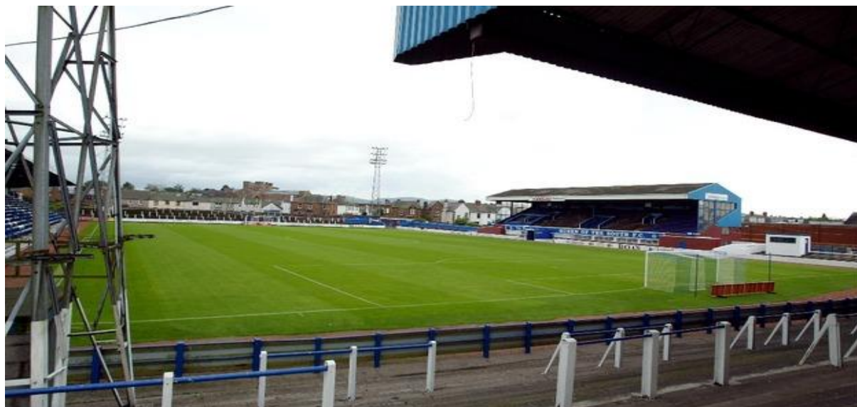
Main Stand and Terregles End

Palmerston Park has been used since 1876 when it was home of Queen of the South Wanderers 1876 – 1893 and was taken over by the 5 th KRV it has a 8,690 capacity, there are 3,377 seats and up until the late 1990s the stadium had a capacity of 8,352, but this was reduced when the Terregles Street End terracing was closed and it was given a safety certificate in September 2014, adding standing capacity of 1,968.